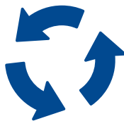
Existing or CrawfordTech's WorkflowTools