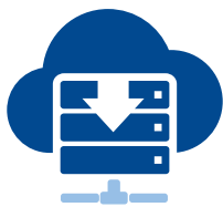
CrawfordTech's SunRise App Server