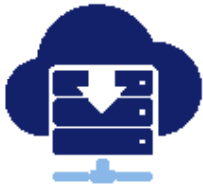
CrawfordTech's SunRise App Server