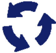
Existing or CrawfordTech's WorkflowTools

The PRO Designer GUI makes configuring Operations Express easy